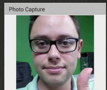
Search functionality to find specific names among a list of registered users.